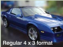
Regular 4 x 3 format