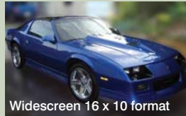
Widescreen 16 x 10 format